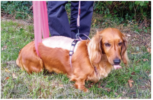
Figure 17 (above left): Carry your dog over any steps or slippery flooring.

Figure 18 (left): If your dog cannot stand or walk without help, support their rear end with a sling.