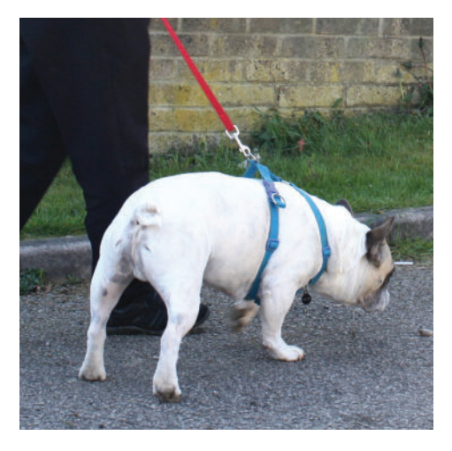
Figure 16: Keep your dog on the lead at all times when outdoors.

If your dog must go outdoors, keep them on the lead at all times.